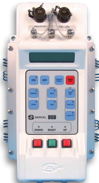
VE464 - DSD