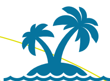
Logistical Oversight Monitoring