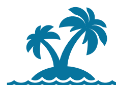
Vessel efficiency Fuel equipment monitoring